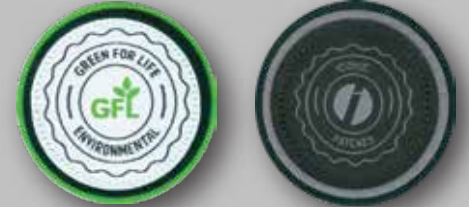
2 Layer Felt Patches